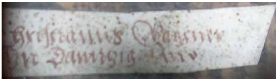
The maker's or repairer's label in the lute